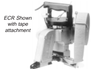
ECR Shown with tape attachment