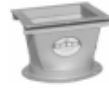
Square to Round Transition