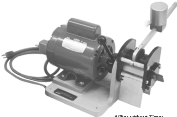
Miller without Timer

The Seedburo No. 2 Miller tests rice samples for milling quality, grading, color and style. This miller can duplicate the No. 3 Seedburo Miller results. Designed primarily for the rice buyer as a guide. Not meant to replace the No. 3 Miller as a grading machine. Sample size approx. 160g. Equip-ped with 1/3 HP, 1 PH motor. Net wt. 38 lbs., Ship wt. 42 lbs. Ship Dims. 17" L x 13" W x 11" H.