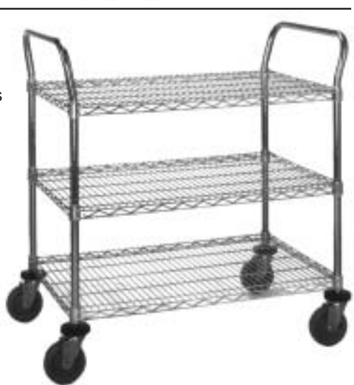
3-Shelf Heavy Duty Utility Cart