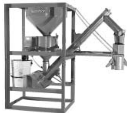
ON FARM TREATER

The Model OFT (On Farm Seed Treater) is a compact, portable, lightweight unit for treating a variety of seeds. Easy to transport for use at temporary treating locations. Chemical contact parts are made of stainless steel: Metering Tank, Auger, Blending Tube and Two-way Bagger. The coating chamber is inclined with full lighting for optimum coverage. Standard Features Include: (1) Metering Tank for Liquid Chemical, Full Set of Chemical Cups (10, 15, 20 & 30 cc), Two-Way Bagger, Five Gallon Premix Tank, Circulating pump, Independent Power Switches for blending chamber & pump, and all necessary hose & fittings. Capacity of up to 75 bu./hr. of wheat. Dims. Domestic Boxed: 72" x 36" x 60" Ship wt. 425 lbs., Export Crated: 73" x 37" x 67" Ship wt. 600 lbs.