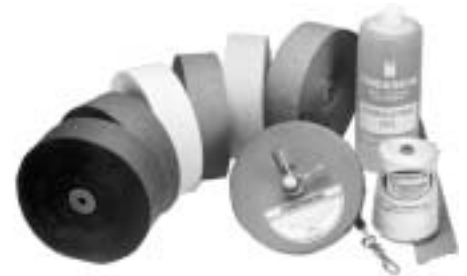
Crepe paper tape, reel-type suspension, lubricating oil and cone of thread.

To Insure Maximum Efficiency from Fischbein Bag Closing Equipment, use these Specially Selected Lubricants: