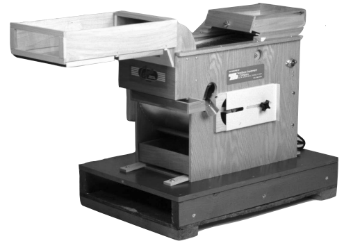
Shown with optional Back Air Catchall with removable trays

The Clipper Model 400 Office Tester & Cleaner offered by Seedburo is an extremely efficient cleaner for office and laboratory use. This machine will provide accurate, dependable performance for small lot cleaning, testing or sampling. It is commonly used in seed plants for sampling large lots of seed for correct screen selection on larger, commercial size cleaners. It is also widely used in university laboratories for agronomy research and testing. Flower and vegetable growers use the Model 400 for specialized cleaning, grading and sizing. The Model 400 has a compact, portable design and features an eccentric (shoe) drive that uses two (2) 10" x 15" screens. One top screen for scalping, one bottom screen for cleaning and grading. Perforated metal or wire cloth screens are available in over 175 different sizes (For screen perforations, see pg. 78). Other features include a powerful bottom blast fan driven by a three-step pulley, adjustable slide on the air intake openings to provide intermediate air regulation and an optional, removable catchall with either removable trays (shown) or solid bottom to catch air screenings. Net wt. 70 lbs. Actual dims 25" L (45 3/4" L with catchall) x 17" W x 23" H. Domestic ship wt. 110 lbs. Domestic ship dims. 32" L x 24" W x 32" H. Export ship wt. 185 lbs. Export ship dims 33" L x 25" W x 33" H.